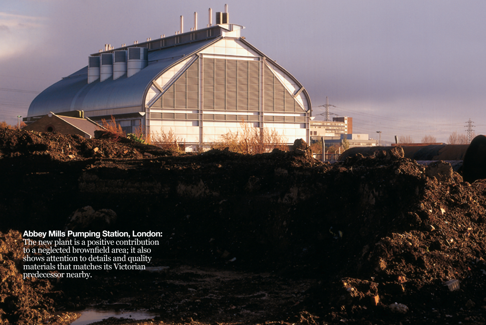
Abbey Mills Pumping Station, London: The new plant is a positive contribution to a neglected brownfield area; it also shows attention to details and quality materials that matches its Victorian predecessor nearby.