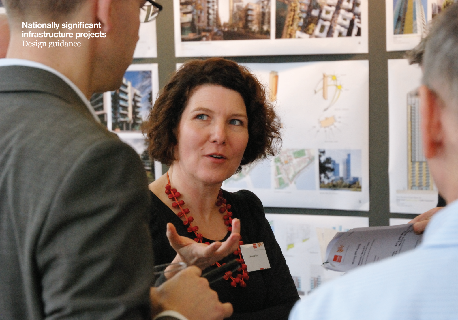
Design review session Panel members discuss the design quality of a proposal

"As a chair of many infrastructure reviews, I have observed how Cabe advice complements the applicants' expertise and adds knowledge in key disciplines around sustainability, design and landscape to support the project through the planning process. The quality of our advice is based on more than ten years of independent design advice, which is provided by a renowned network of experts and covers a wide range of professional experience to respond with a bespoke skillset to specific projects."