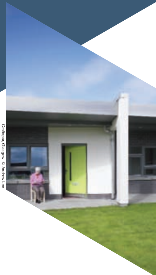
Croftspar, Glasgow

The site is in a run-down residential area. There was considerable opposition to the project, due both to the loss of open space, and rumours about the nature of the development. Partly for these reasons, the scheme was designed to be low-rise, small in scale and modest in its visual and physical impact. The planners insisted the building height should be reduced as much as possible. The scheme is surrounded by other housing but is set back from the road and an area of land has been retained as open space.