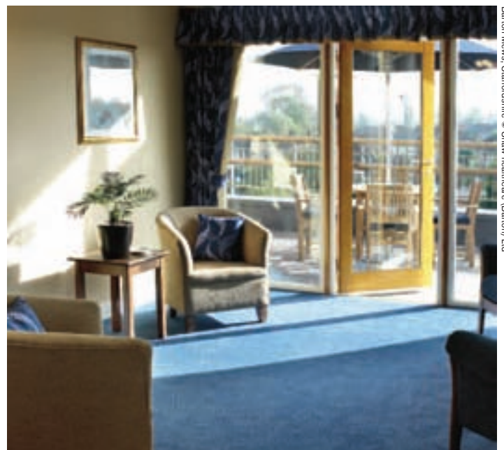
Barton Mews, Staffordshire

There is a nice sense of connection via the public footpath through the garden towards the churchyard and village centre, but it seems unlikely that this could be used by residents with walking frames or even scooters