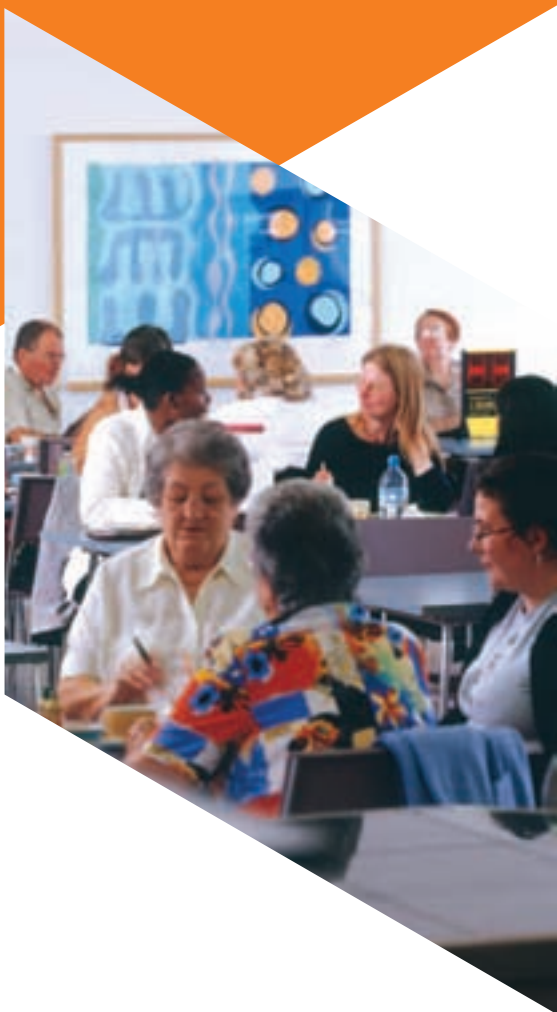
Darwin Court, London

The building has a bright and open public face, which welcomes visitors without compromising the privacy of tenants, underlying the development's close integration with the surrounding community. In the absence of a local pool, the swimming pool is regularly used by schoolchildren during the day. The café is used by various organisations, and the staff members say it is a great place to work in, as well as to live in.