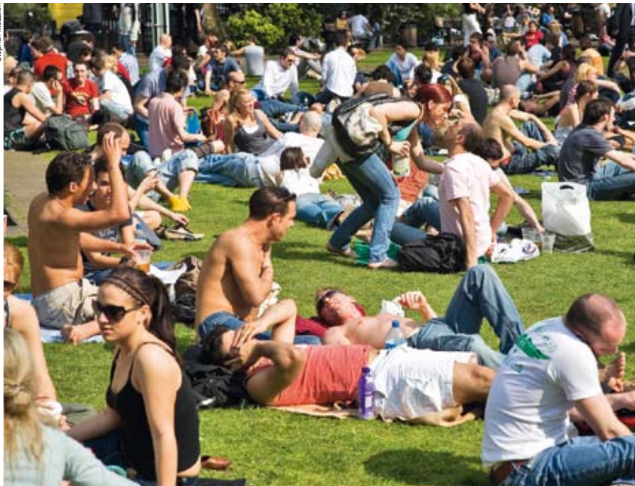
As well as mitigating climate change, green space plays a vital role in making summers more comfortable

Adaptation investment should include mitigation of climate change where possible as well. That way, the future could be less harsh than some predictions suggest.