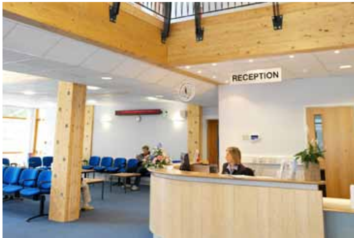
© Chaplin Farrant Architects, Richard Leeney

The award-winning Swaffham Surgery is one of the best-performing new buildings in the NHS estate. The cost implications were dealt with pragmatically by the architect, the contractor and Norlife LIFTco, with the carbon footprint reduced through sustainable building materials, clever orientation and passive temperature control.