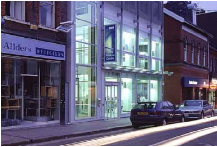
David Worley architects

Luton Walk-in Centre is a four-storey, patient-focused facility in central Luton next to a busy shopping street. There are minor treatment areas and flexible spaces for drop-in clinics. The volume of patients is high and throughput is fast. The PCT carried out a thorough site search and appraisal, and made creative use of an existing building.