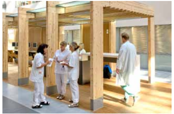
CF Møller architects

At Akershus Hospital, Oslo, a motorised system distributes medication from a pharmacy store in the hospital direct to wards using robots. Clean, sterilised staff uniforms are distributed daily from vending machines to keep hygiene levels as high as possible by removing the necessity for staff to bring their uniforms in and so helping to keep infection levels down.