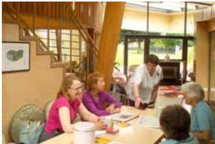
Maggie's Highlands, Inverness. Page & Park architects

Maggie's Cancer Care Centres offer a community of advice and support for cancer patients within carefully designed and welcoming buildings that have a domestic feel. Each centre is situated beside an NHS cancer hospital and has been designed to be as uninstitutional as possible, with light, space and warmth. The heart of the centre is always the informal kitchen area (such as here at Maggie's Inverness).