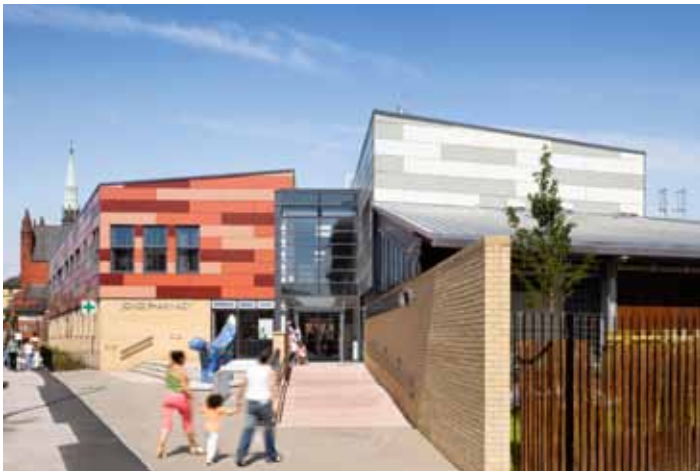
Picton Health Centre, MBLA architects

Liverpool PCT and Liverpool & Sefton LIFTco have joined up their thinking for the equitable provision of healthcare facilities across the city. After surveying residents and pinpointing an optimum 15-minute maximum walking time to any health centre, a new network sites centres across the city within 15 minutes' walk of every residential address. The partnership also provides services in the evenings and at weekends. www.lshp.co.uk