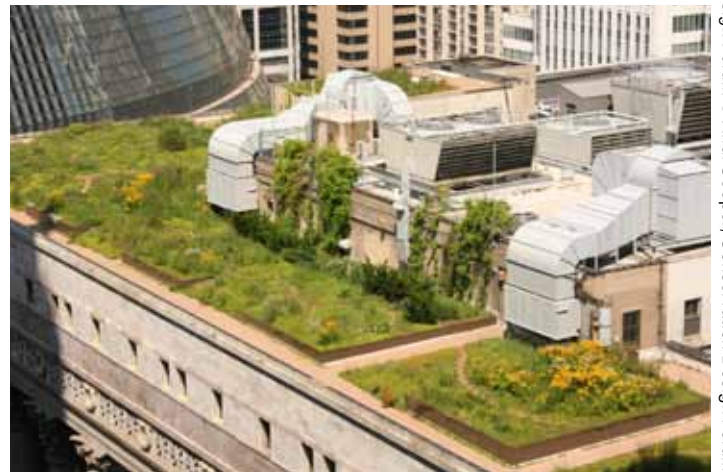
Conservation Design Forum

The city of Chicago has enacted legislation that requires landscaping around parking lots and more energy-efficient building practices. The council encourages residents to use light-coloured, reflective materials for roofs, to plant trees on properties to increase the shading of buildings and parking lots, and to increase the amount of vegetation overall. Projects include a rooftop garden on City Hall which has set the precedent for green roofs in the city, a permeable and reflective alley on the North Side, miles of median planters and many campus parks that transform asphalt parking lots around public schools into parks. Chicago also uses green building technologies and practices in all of its public building projects. www.cityofchicago.org