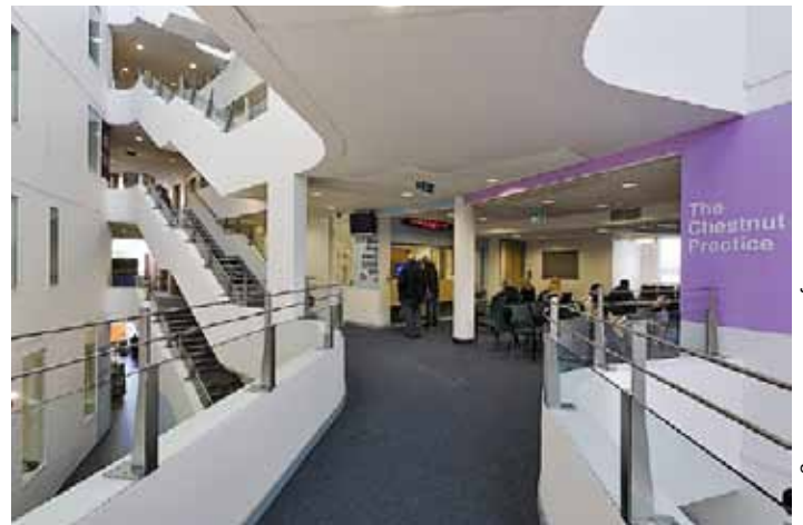
Penoyre & Prasad architects

At the Heart of Hounslow LIFT building, two wings containing health and social services and office spaces are suitable for business, health, social and community use and are designed to be flexibly used for whichever service may need to operate in the area. A covered communal street creates a mall-like informal meeting space for the community, and a public plaza sits at the front for the surrounding neighbourhood.