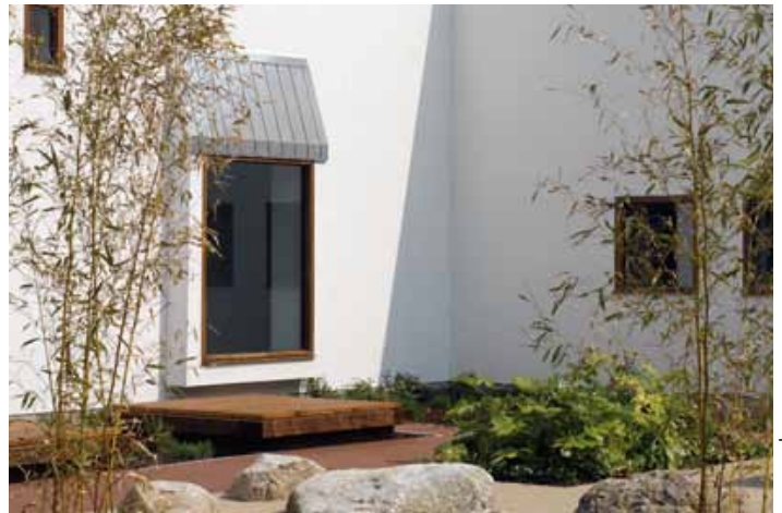
MAAP architects

At the Bamburgh Clinic, St Nicholas Hospital, Newcastle, a mental health unit was designed to provide a secure but therapeutic environment for patients, many of whom require long-term care. The vision was to provide a non-stigmatising environment by enabling the necessary observation through design, providing good daylight, views and access to outdoor space.