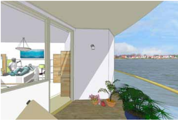
Hygiopolis, MAAP architects

The Hygiopolis city planning project, conceived by Medical Architecture and Art Projects (MAAP), hypothesises a city in the future where healthy lifestyles and access to healthcare are priorities. It emphasises active and public transport systems, accessible green and blue spaces, adaptable homes suitable for care at home, and integrated services. A 'neighbourhood centre' is proposed, with a primary school, facilities for older people, community mental health nurses, social workers and GPs all on one site. cabeurl.com/8b